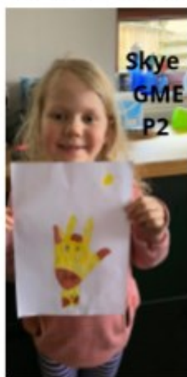
Skye GME P2